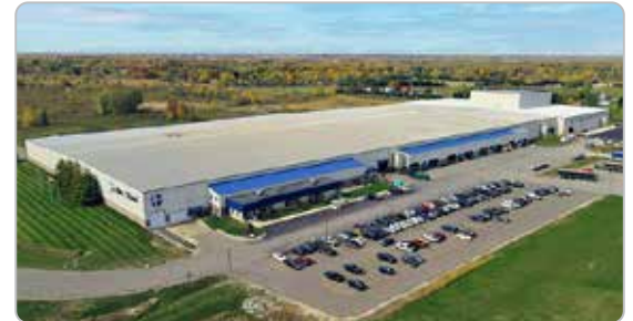
Pictured, the Alro Steel facility in Pottsville, Michigan